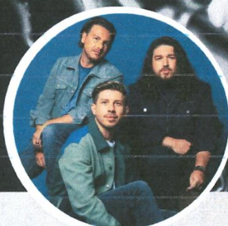
CONSUMED BY FIRE