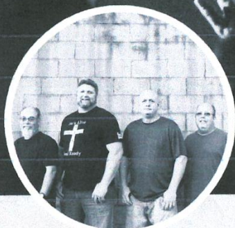
MERCY FALLS PRESHOW